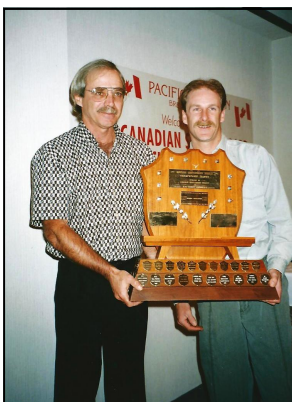
1st Place Men's Doubles 1997 Victoria BC

He held the league president position for a several years.